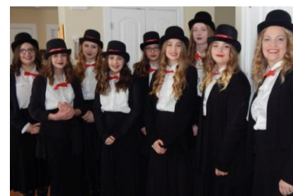
Delivering Singing Valentines!