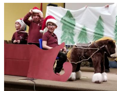
A highlight of the Dessert Theatre

During the Christmas season, HCS celebrated with a Festival of Trees. Students picked a theme and decorated their tree accordingly. Rave reviews were heard from the guests who attended our Dessert Theatre during the weekend it was held. People’s Choice went to the team of boys who decorated the Cars tree. A great job was done by everyone.