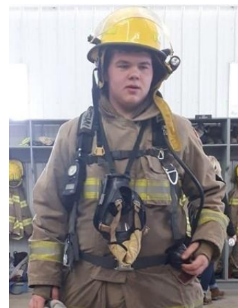
Honour Roll students enjoyed a field trip that included a tour of the Fire Station in Fredericton Junction.