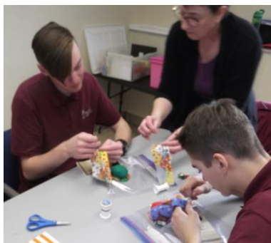
Learning life skills

Many Science PACEs contain projects and labs that students do to enhance their learning. Some of our high school students enjoyed Biology dissections in the fall, and these intermediate students took the opportunity to view bread mold.